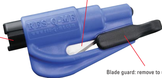
Blade guard: remove to use.

Window breaker: push this end of the tool against a side window until the concealed spring-loaded spike releases and shatters window. The spike is self-resetting and may be used many times. About 12lbs (5kg) of force needed.